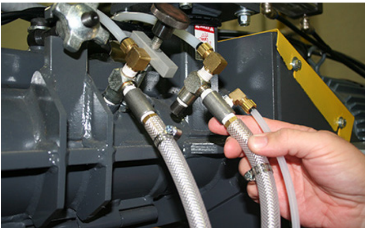
Air assisted jet assembly removed from the mixing chamber for physical calibration.

while the inside remains at the original ambient temperature. High temperature of portions of the fluid can cause solvent evaporation or resin advancement. The performance, viscosity, and metering characteristics of the chemicals may all change and vary with this method of temperature control.