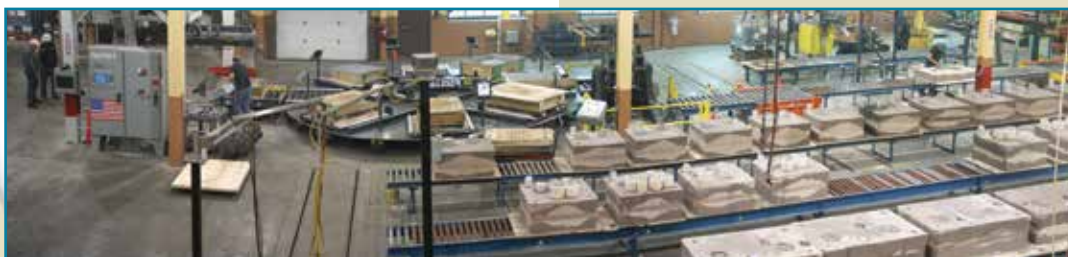
Foundry Molding Loop