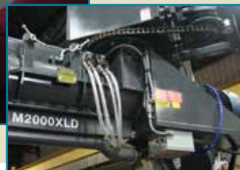
Electromechanical Power Rotation