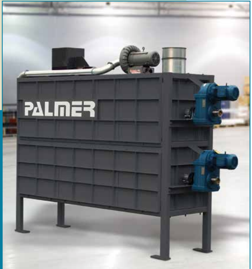
TSR-Series Thermal Reclamation System