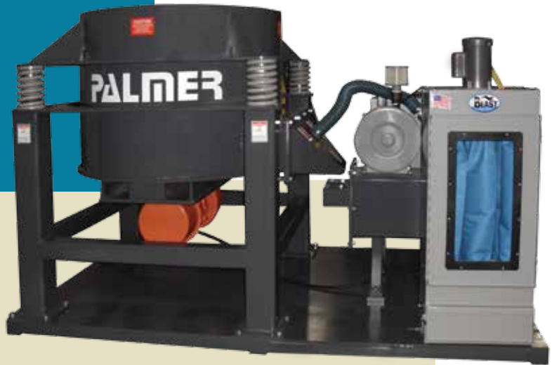
CAR-Series Mechanical Reclamation System (Shipped complete with very little on-site assembly required)