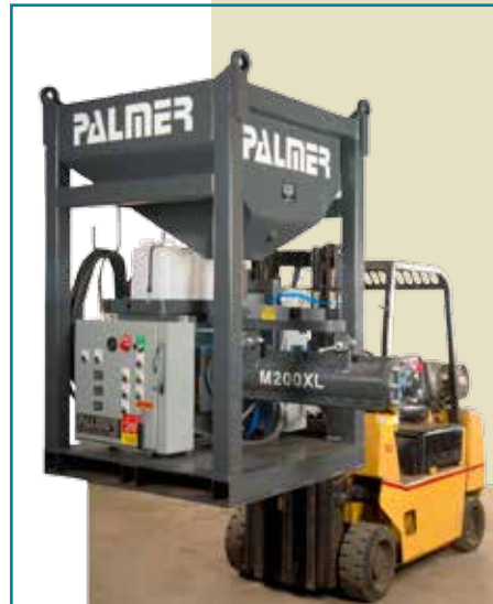
Portable Cube Mixer