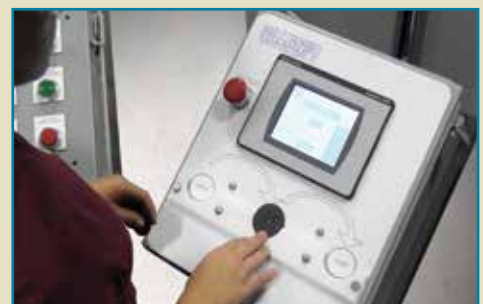
RFID Tag Read and Write Station