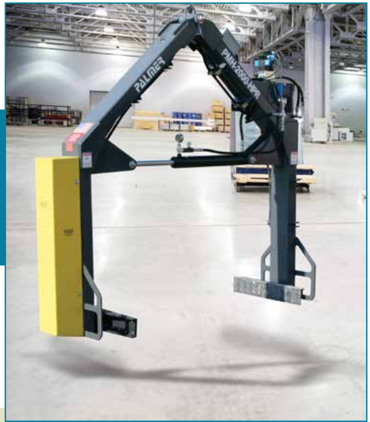
PMH-2000 -HPR Scissors

The PMH line of mold handlers offers our customers a complete set of options when it comes to handling both flasked and flaskless molds. From our basic scissor-style to our full line of high capacity gantry-style units, there is a size and configuration for all requirements. No-slip urethane gripper pads available for a safe secure grip on thin-wall molds. Available in hydraulic and electric models.